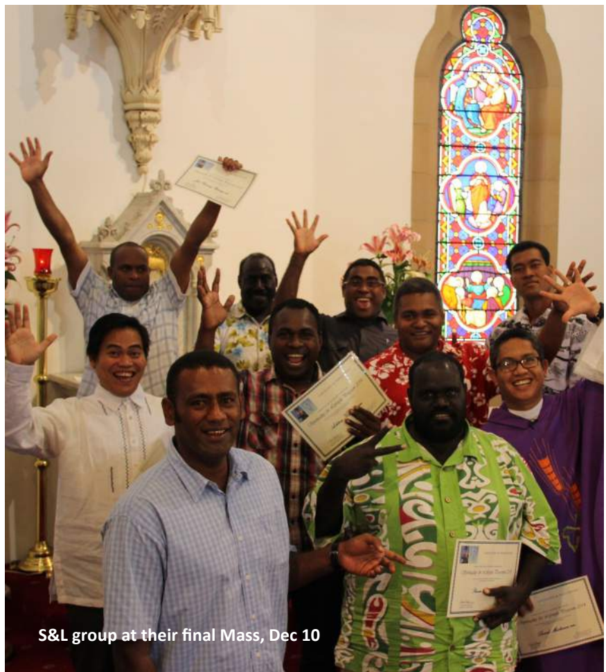
S&L group at their final Mass, Dec 10

The proposal being put to the Assembly Preparatory committee by the Provincial Council is that we hold a regional meeting in February 2015 where we will discuss these three reports and other things in preparation for the Assembly to be held in October.