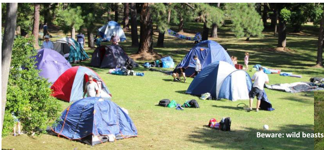
Beware: wild beasts